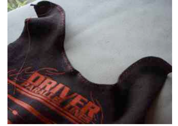
2. Sew folded neck edge (front and back) with zig-zag stitch. Try to not allow neck edge to stretch too much. Hem will still be a bit wavy. (this step is the trickiest and can take some practice.)