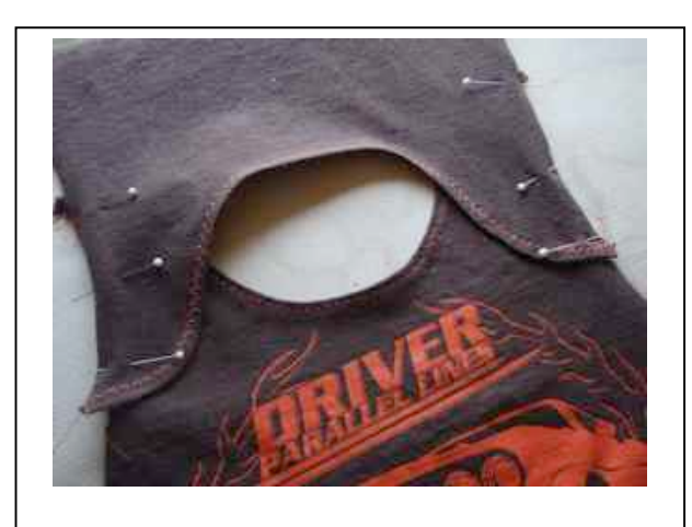
4. Overlap back over front at shoulders, matching marks. Machine baste to hold in place.

3. Press neck edges on front and back to flatten out any "waves".