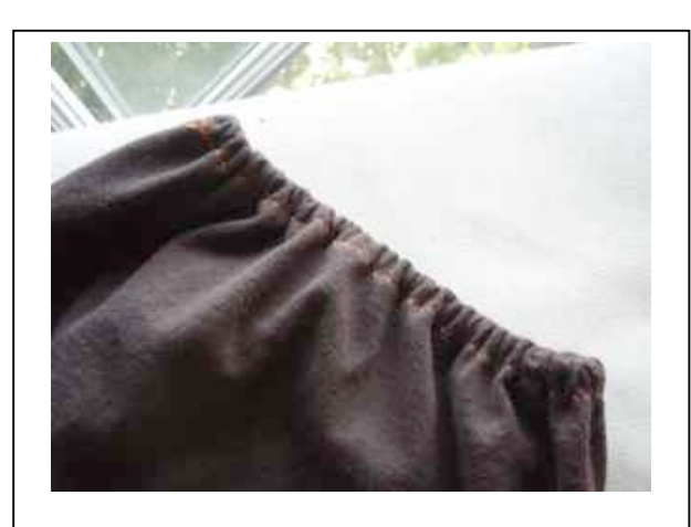
8. Hem bottom of gown 1/2" leaving a 1" open space. Insert 14" piece of soft stretch elastic (from 1/8" wide to 3/8" wide). Sew ends of elastic together and close up hem opening.

7. Hem sleeves 1/2" unless you have cut sleeves using existing hem of shirt.